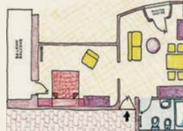
Schlern Attic-Suite 1x 40 m 2 for up to 4 pers. 1x 50 m 2 for up to 5 pers. South-facing, both with 2 small balconies