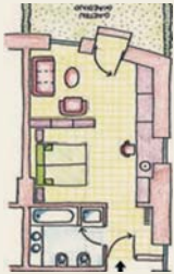
Garten double room 2-4 person South-facing onto the park with garden terrace ca. 40 m 2