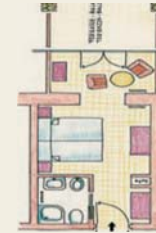
Liberty double room South-facing with porch and terrace ca. 28 m 2