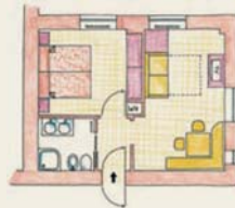
Ortlert Suite 2-4 person North-facing ca. 39 m 2