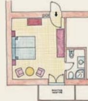
Nostalgia double room North-facing with balcony ca. 28 m 2