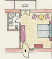
Jugendstil double room South-facing with balcony ca. 30 m 2