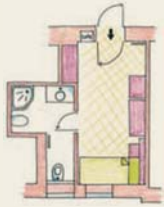
Nostalgia single room North-facing ca. 18 m 2

All rooms with bath or shower, colour TV and SAT, safe and direct call telephone. All suites and apartments comprise bedrooms, living rooms with extendable double settee or bunk bed, bath or shower, colour TV and SAT, safe and direct call telephone. In every room and apartment you will find a hairdryer, bath robe and slippers for every resident.