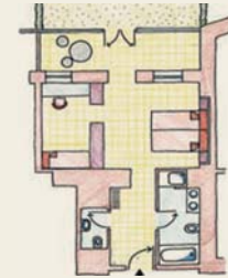
Familien-Garten Latemar Apartment South-facing onto the park with porch and private garden ca. 45 m 2 . Sep.children's room