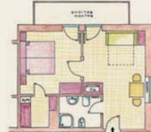
Rosengarten-Suite 2-4 person South-facing with balcony ca. 40 m 2